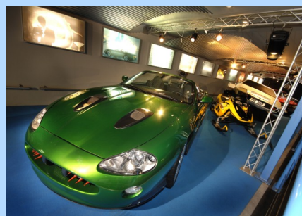
Jaguar XKR Roadster at the National Motor Museum, Beaulieu

AM - Take a leisurely stroll or cycle through the New Forest National Park or visit the National Motor Museum, Beaulieu , home to over 250 world famous motors as well as the Cistercian Beaulieu Abbey and Palace House and gardens.