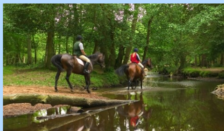
Horse riding in the New Forest