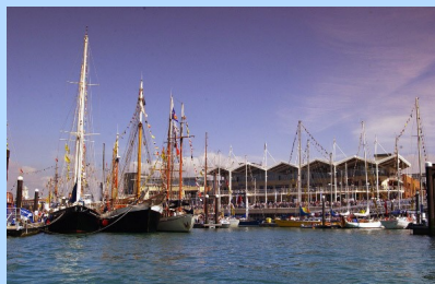
Gunwharf Quays and war ships

Return to London Gatwick (A3, 90 minutes)