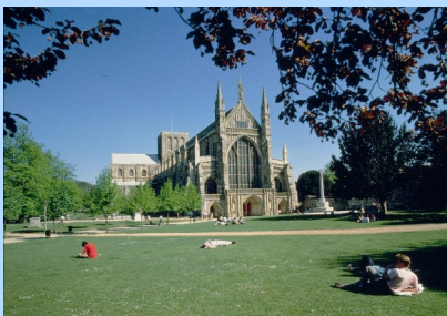
Winchester Cathedral and grounds

PM - Drive to Southampton (15 minutes, M3/M27). Modern day cruise capital and famous departure port of the fateful Titanic sailing. 2012 marks the opening of the new Sea City Museum , celebrating Southampton's rich maritime heritage. Take a guided walk to discover the city's poignant Titanic links.